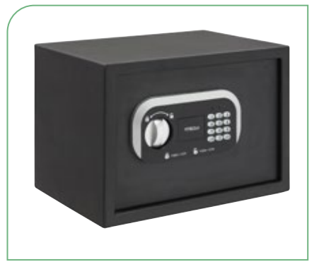
Available in 2 sizes.