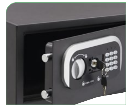
Mechanical key override for emergency opening.