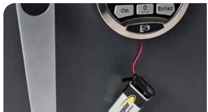
Powered by a 9V battery