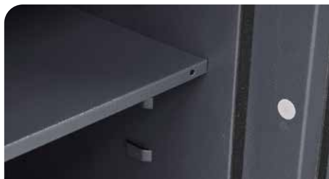
Interior tray adjustable in height