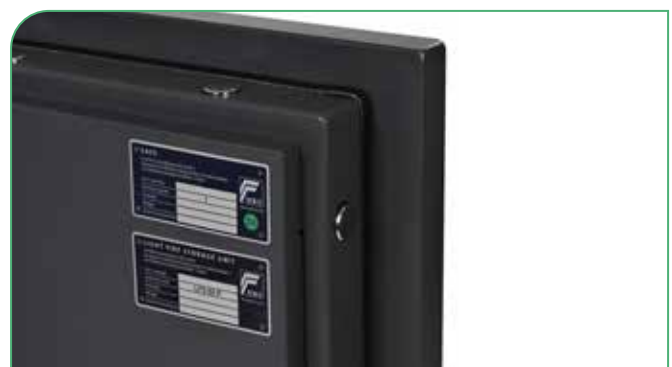
Fire resistance: LFS60P certified Theft resistance: Grade I certification