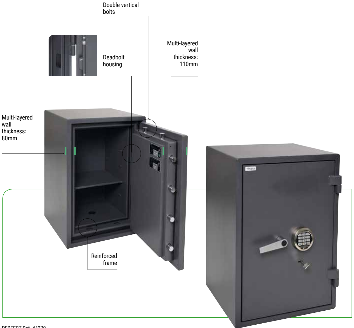
PERFECT Ref. 44270