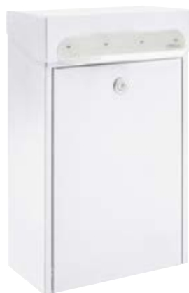
WHITE EP1001 EAN-8425181738375