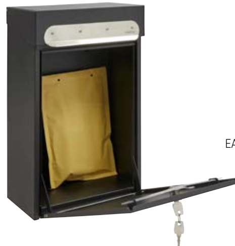
BLACK EP1004 EAN-8425181738382