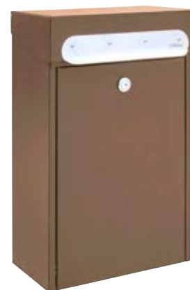
RUST EP1008 EAN-8425181738399