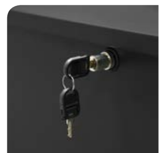
Open with a key to retrieve parcels.