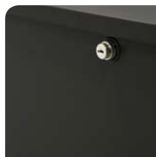
Locked: the lid cannot be opened.