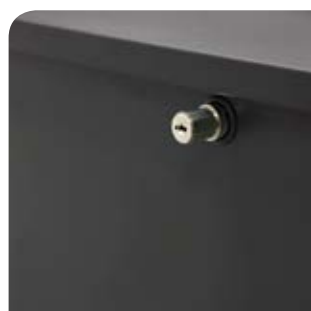
Unlocked: ready for depositing parcels.