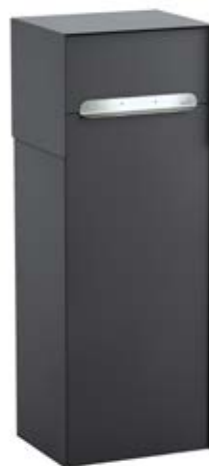
BLACK EP3154 EAN-8425181738511

There is a double-access model available with a mail slot that opens onto the street and a door that opens onto the inside of the home, so the parcels can be retrieved from inside the building.