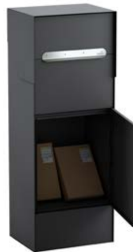
BLACK EP3104 EAN-8425181738504