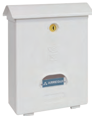
White/ E-1071 * 721247