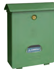
Green/ E-1073 * 721025