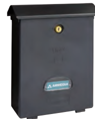
Black/ E-1074 * 721032