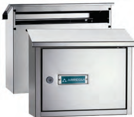
Stainless steel mirror finish/ V-4077 * 140772