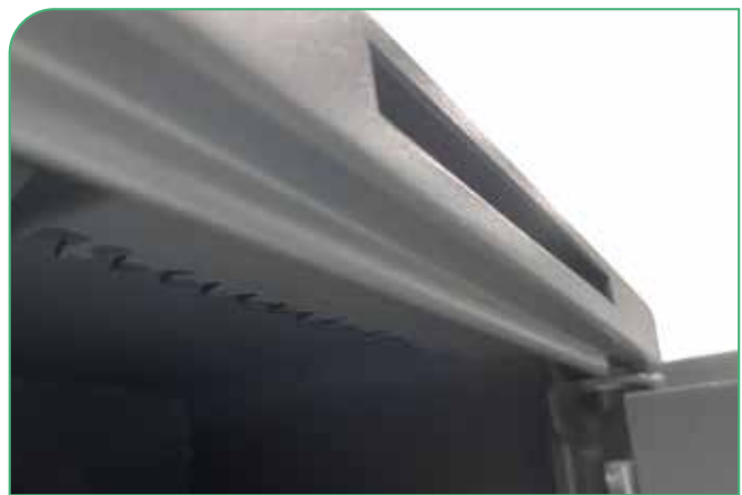
Secure "anti-fishing" system to prevent the contents from being extracted from the exterior.