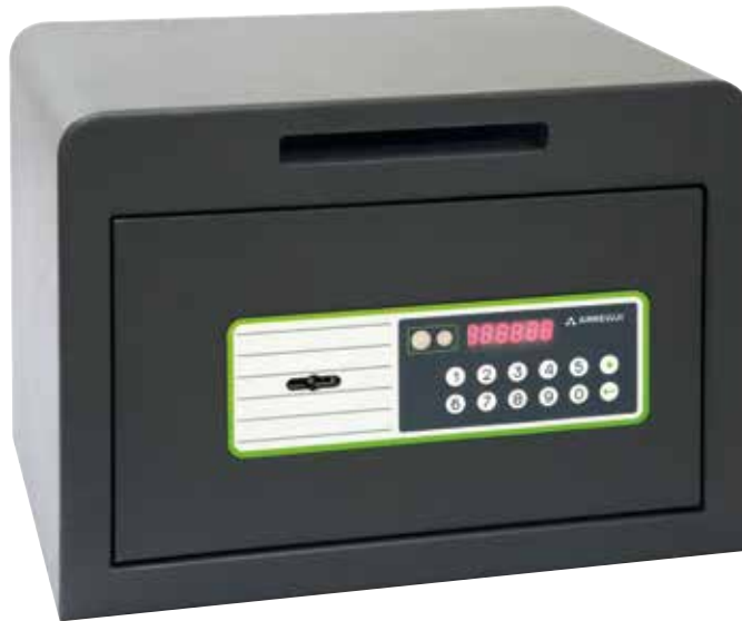
SUPRA WITH SLOT Ref. 240020-SL