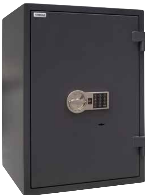
SÚA Ref. 400050 Electronic opening + key