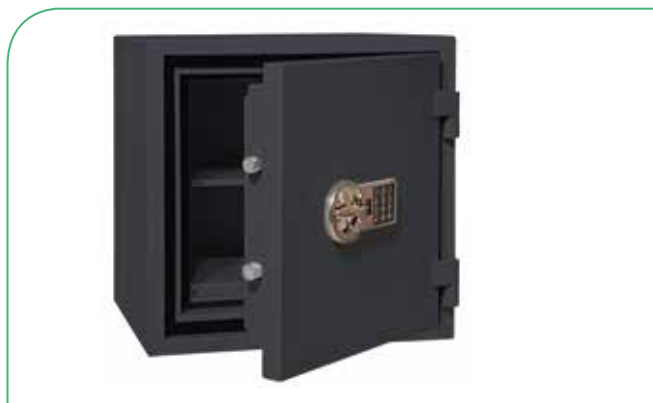
Ref. 400140. Electronic opening