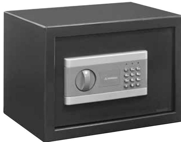
STYLO Ref. 19000-S2