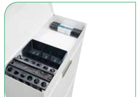
Upper tray for storing batteries, coffee pods, etc.