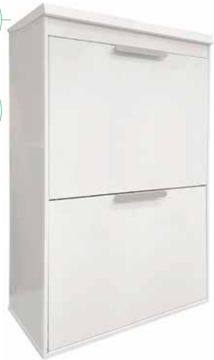
ECOCLAS PLUS CR621-E

UPPER TRAY for storing bags, batteries, coffee pods, etc.