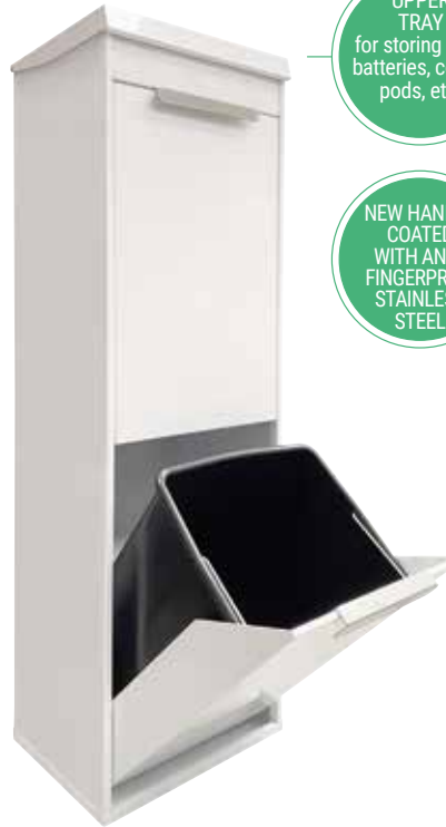
ECOCLAS PLUS CR221-E