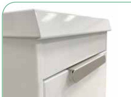
Handle with anti-fingerprint stainless steel coating